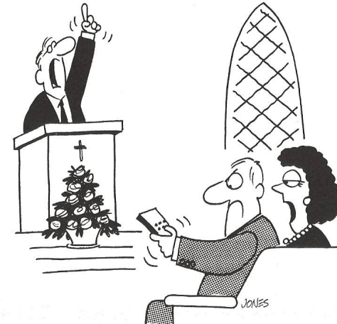
"I'M SORRY, DEAR, BUT YOUR REMOTE CONTROL DOESN'T WORK IN CHURCH!"