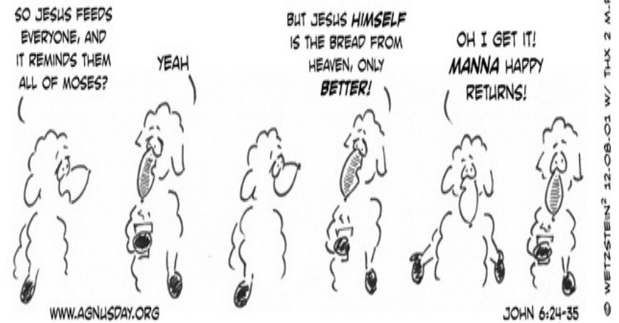
Agnus Day appears with the permission of www.agnusday.org