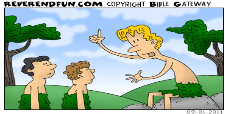
I SUPPOSE YOU COULD SAY THAT YOUR GRANDPA IS GOD ... FOR BOTH SIDES OF THE FAMILY

LWML will be meeting at Faith on Tuesday, September 9 th at 7:30 p.m.