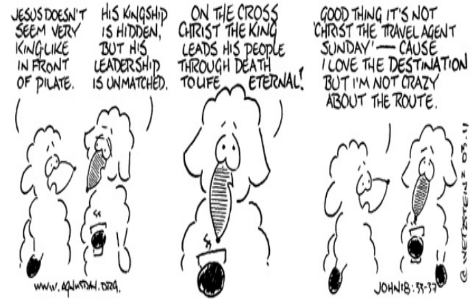
Agnus Day appears with the permission of www.agnusday.org