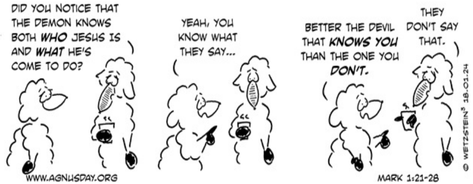
Agnus Day appears with the permission of www.agnusday.org