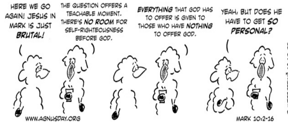
Agnus Day appears with the permission of www.agnusday.org